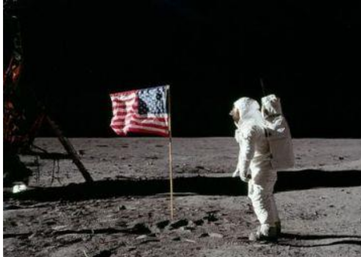
Buzz Aldrin