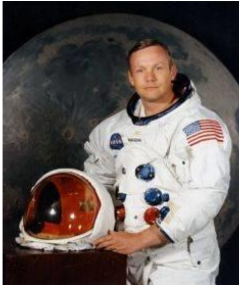
Neil Armstrong